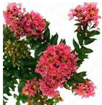
Crape Myrtle ( Lagerstroemia indica ) *** 10-30h x 15-30w