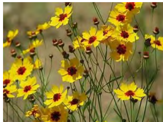
Coreopsis spp.*** 1-4 h x 1-3 w Many varieties