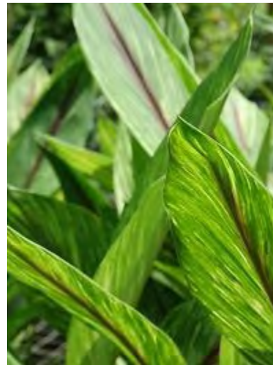
Hidden Lily ( Curcuma spp.)*** 1-6 h x 1-4 w Many varieties available