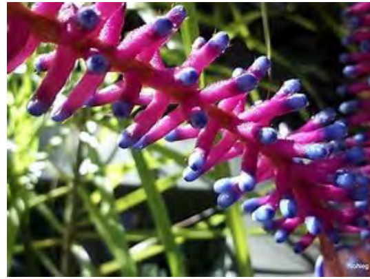
Bromeliads ( Bromeliad spp.) ** many sizes and colors