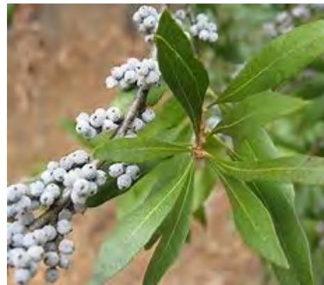
Wax Myrtle ( Myrica cerifera ) *** 10-40 h x 20-25 w