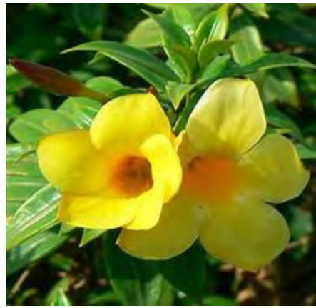
Bush Allamanda ( Allamanda nerifolia ) ** 5-15 h x 4-10 w