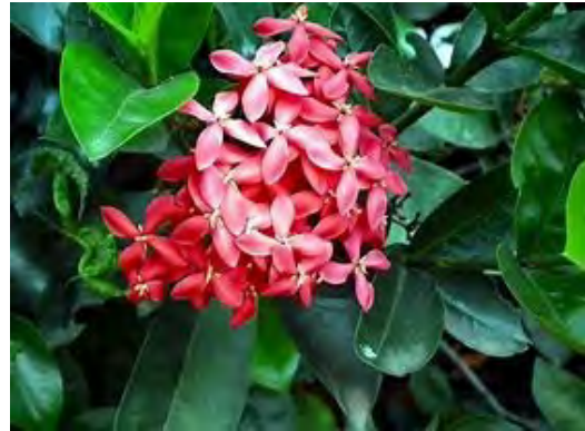
Ixora ( Ixora coccinea ) *** 10-15 h x 4-10 w