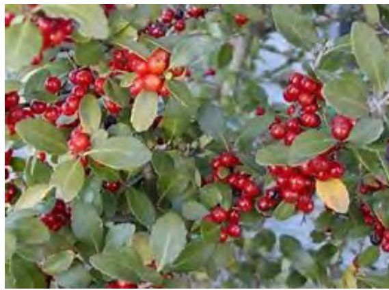
Yaupon Holly ( Ilex vomitoria ) *** 15-30 h x 6-20 w