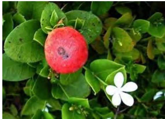
Natal Plum (Carissa macrocarpa) *** 2-20 h & w