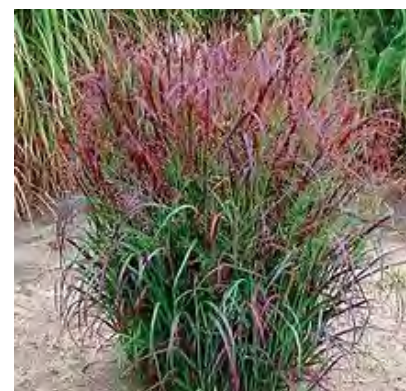
Switch Grass ( Panicum virgatum ) *** 3-6 h