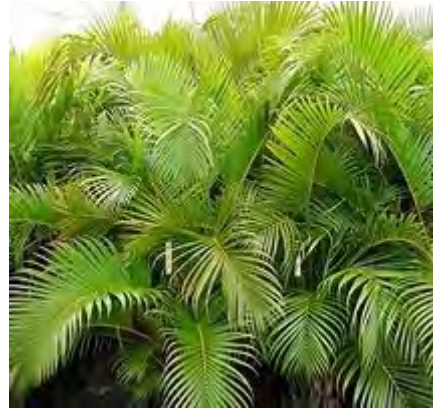
Areca Palm ( Dypsis lutescens ) ***