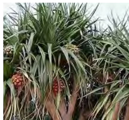
Pandanus ( Baptisia aurea ) *** 5 h