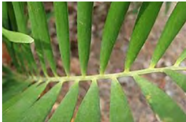
Coontie ( Zamia floridiana ) **