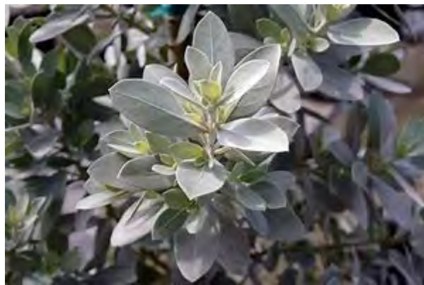
Buttonwood ( Conocarpus erectus ) *** 5-50 h x 15-20 w