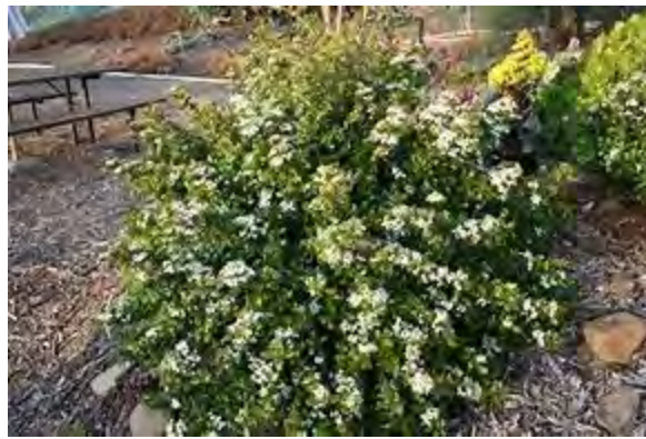
Walter's Viburnum ( Viburnum obovatum ) ** 8-25 h x 6-10 w