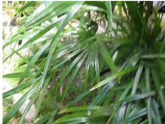
Needle Palm ( Rhapidophyllum hystrix ) **