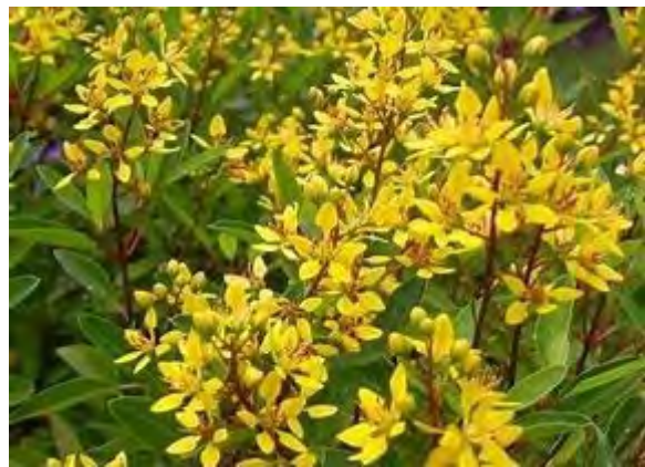
Thyrsallis ( Galphimia glauca ) *** 5-9 h x 4-6 w