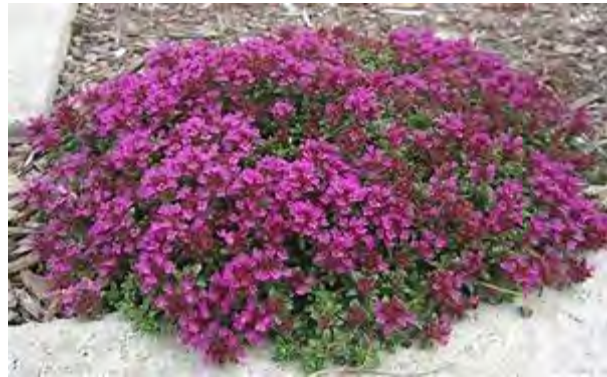
Creeping Thyme ( Thymus praecox ) **