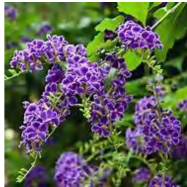
Gold Mound ( Duranta repens ) ** 2-3 h x 2-3 w