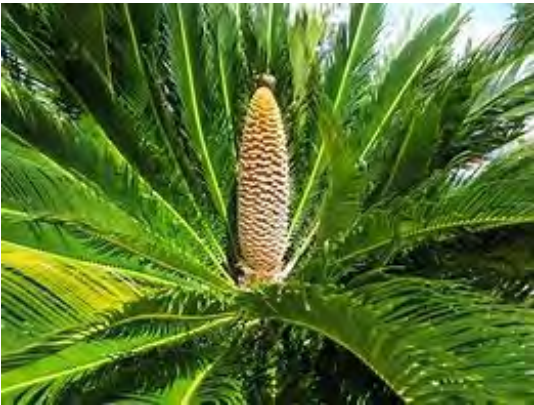
Sago Palm ( Cycas revoluta ) ***