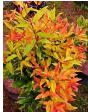
Stoppers ( Eugenia spp.) *** 10-30 h x 5-20 w