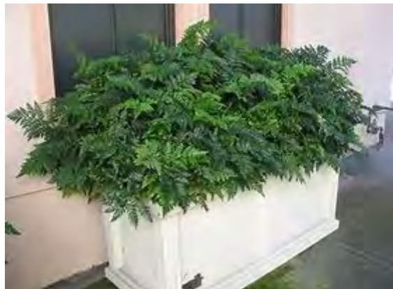
Leatherleaf Fern ( Rumohra adiantiformis )*