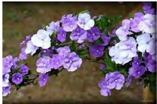
Yesterday, Today and Tomorrow ( Brunfelsia grandiflora ) *** 7-10 h x 5-8 w