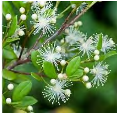
Simpson's Stopper ( Myrcianthes fragrans ) *** 6-30 h x 4-7 w