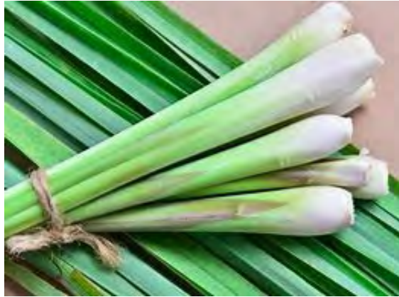
Lemon Grass ( Cymbopogon citratus ) *** 4-6 h x 4-6 w