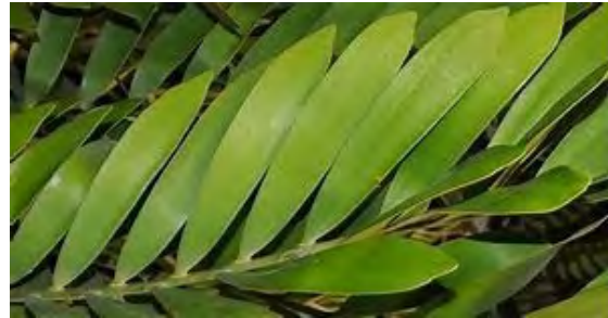
Cardboard Palm ( Zamia furfuracea ) ***