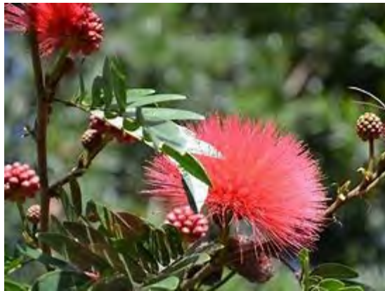
Powderpuff ( Calliandra ) *** 10-15h x 8-15w