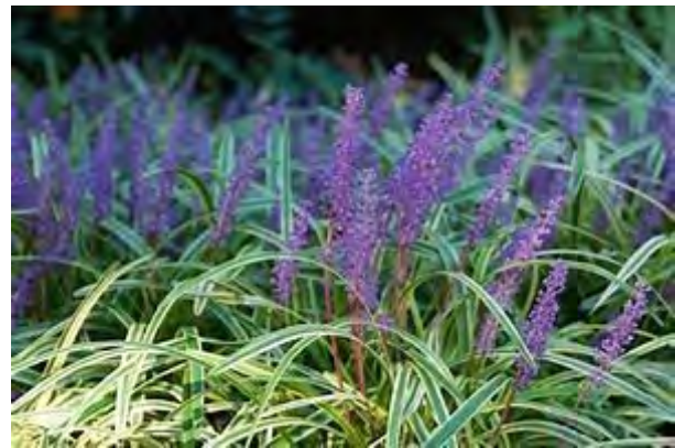
Lily Turf ( Liriope muscari ) ** .5-1H x 1-2 w