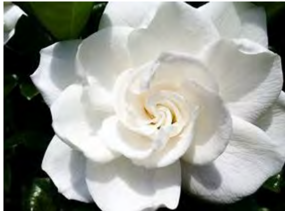
Gardenia, Cape Jasmine ( Gardenia jasminoides ) * 4-6 h x 4-8 h