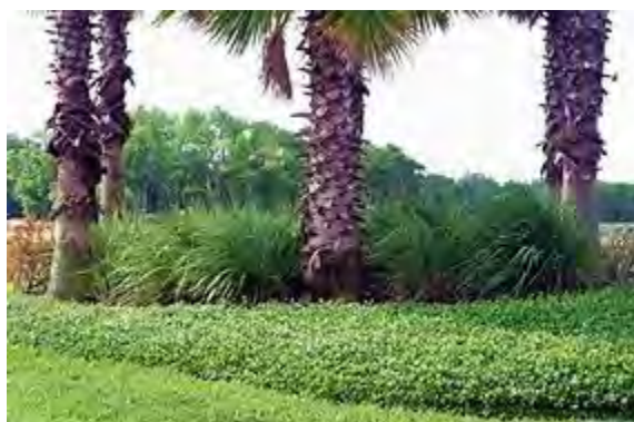
Fakahatchee Grass ( Tripsacum dactyloides ) *** 4-6 h