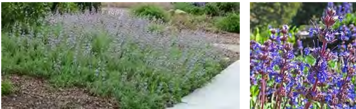
Creeping Sage ( Salvia misella ) **