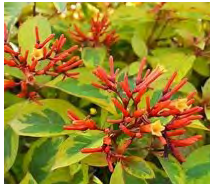
Firebush 'Dwarf Lime Sizzler' ( Hamelia patens ) ** 5-20h x 5-8 w