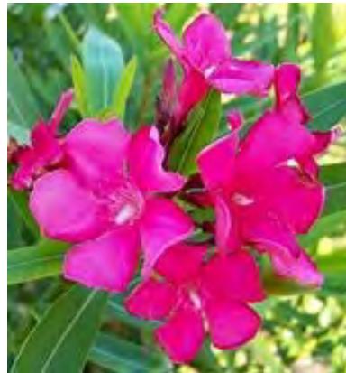
Oleander ( Nerium oleander ) *** 4-18 h x 3-15 w