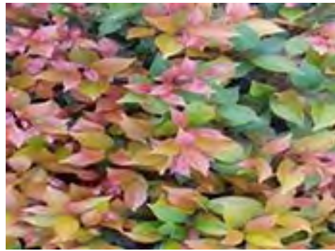
Dwarf Pilly Lilly ( Allyn Magic ) **