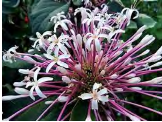
Starburst Shrub ( Clerodendrum quadriloculate ) *** 15 h x 10-15 w