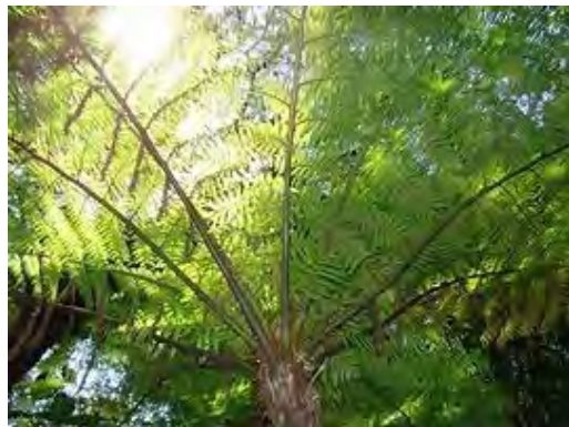
Australian Tree Fern ( Dicksonia antarctica ) *