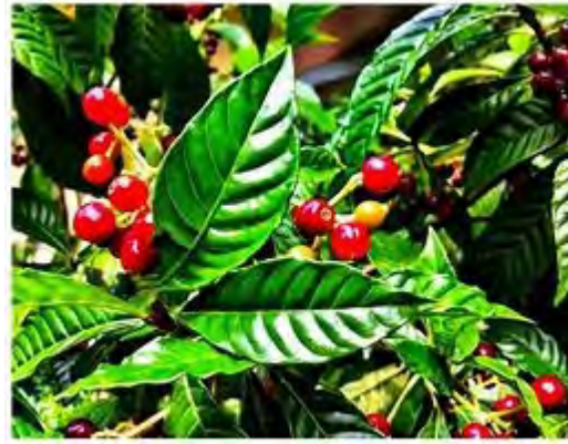
Wild Coffee, dwarf ( Psychotria nervosa ) *** 3 h x 3 w