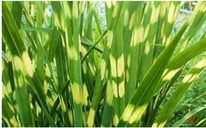
Zebra Grass ( Miscanthus sinensis ) *** 5-7 h