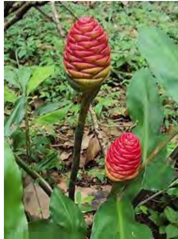
Ginger ( Alpinia zerumber variegata ) ** 3-5 h x 3-4 w