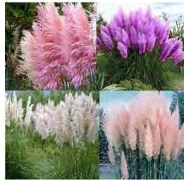
Pampas Grass ( Cortaderia selloana ) *** 9 h