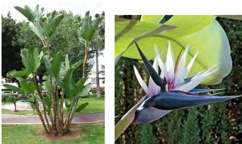
White Bird of Paradise ( Strelitzia Nicolai )