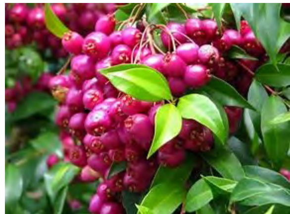
Lilly Pilly ( Acmena smithii 'Allyn Magic') *** 1.5 h