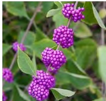
Beautyberry ( Callicarpa Americana ) *** 6-8 h x 4-6 w