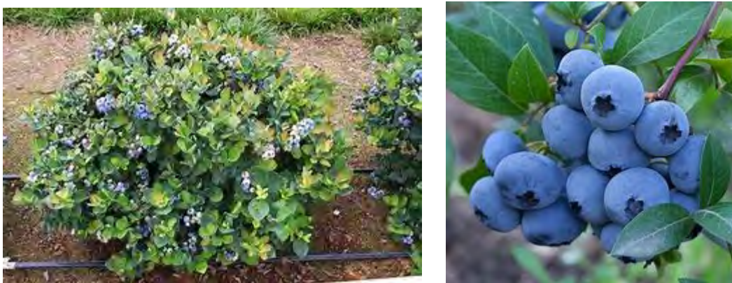
Florida Blueberry ( Vaccinium darrowii ) *** 12-15 h x 8-10 w