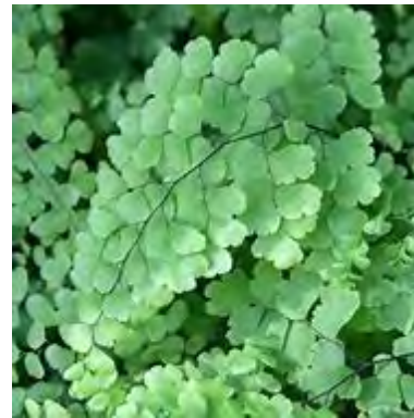
Southern Maidenhair Fern ( Adiantum capillus-veneris )*