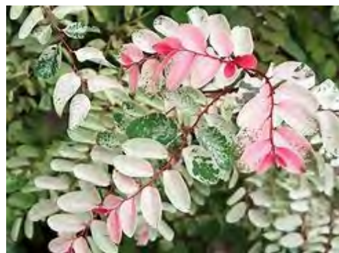
Snowbush ( Breyntia disticha ) *** 5-8 h x 4-7 w