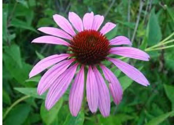
Purple Coneflower (Echinacea purpurea)** 3 h x 2-3 w