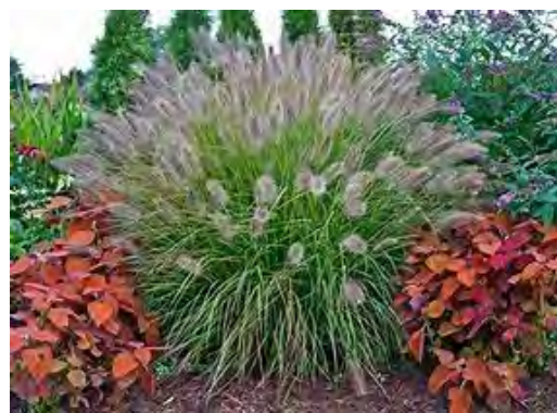
Fountain Grass ( Pennisetum setaceum ) *** 5 h x 3 w