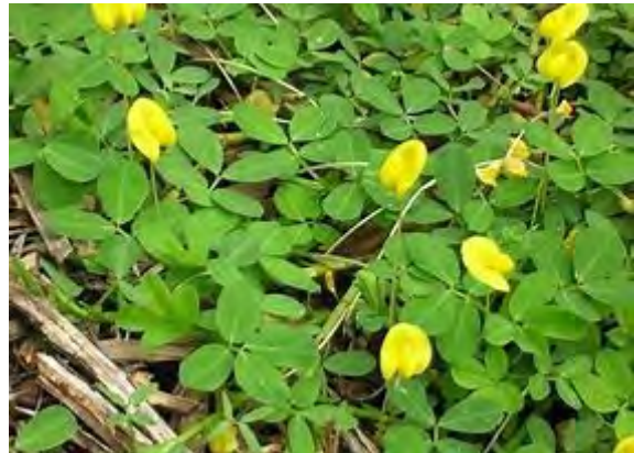
Perennial peanut ( Arachis glabrata ) ***