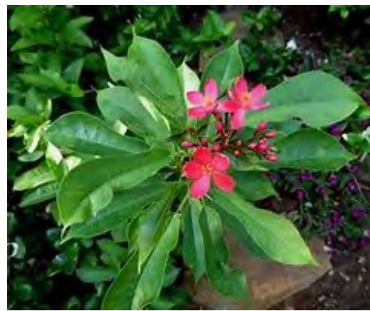
Peregrina ( Jatropha integerrima ) *** 8-15 h x 5-10 w