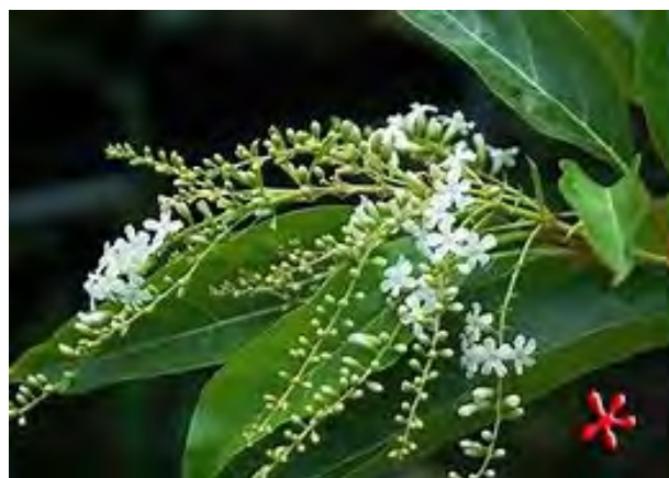
Fiddlewood ( Citharexylum spinosum ) *** 15-25h