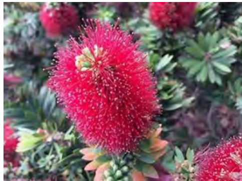
Bottlebrush ( Callistemon ) *** 6-30h x 6-15w