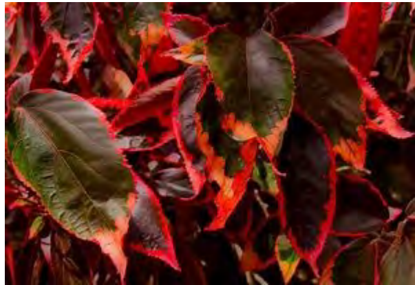
Copperleaf ( Acalypha wilkesiana ) ** 8-12h x 6-8 w