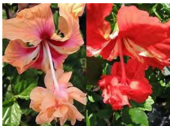
Hibiscus ( Hibiscus spp.) *** 4-12 h x 3-10 w