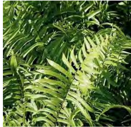
Macho Fern ( Nephrolepis biserrata )*