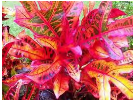
Croton ( Codiaeum variegatum ) ** 3-8 h x 3-6 w