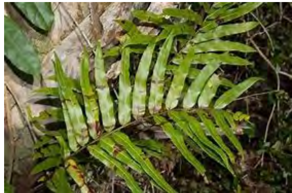
Leather Fern ( Acrostichum danaeifolium )*