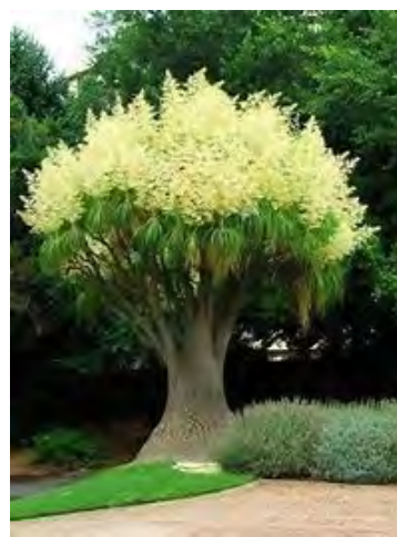
Ponytail Palm ( Nicolina recurvata ) ***