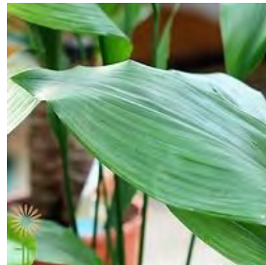
Cast Iron Plant ( Aspidistra elatior )** 1-3 h