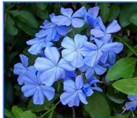
Plumbago ( Plumbago auriculata ) *** 6- 10 h