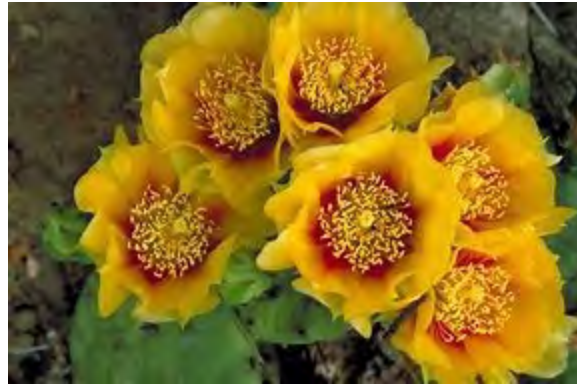
Prickly Pear ( Opuntia spp.) *** various kinds and colors