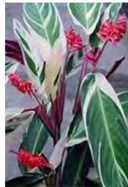
Stromanthes (Triostar ginger) * 2-3 h x 2 w