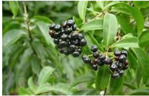
Marlberry (Ardisia escalloniodes) ** 10-20h x 3-12 w