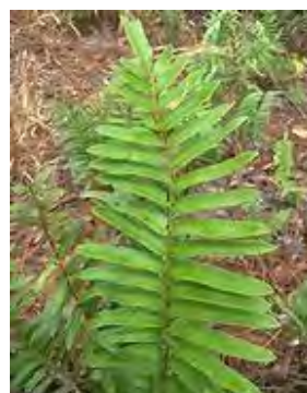
Swamp Fern ( Blechnum serrulatum )**