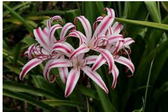
Crinum Lily ( Crinum spp.)*** 3-6 h Many varieties available