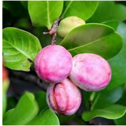
Cocoplum ( Chrysobalaus icaco ) *** 3-30h x 10-20 w