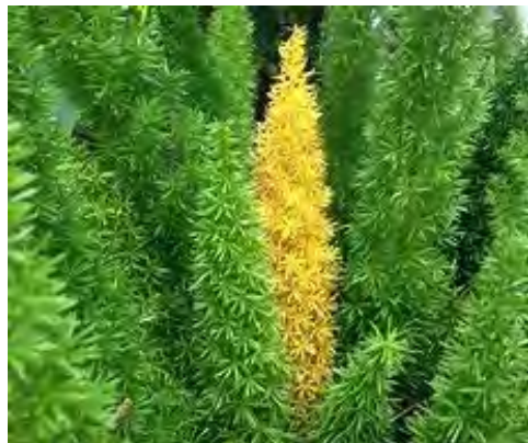
Foxtail Fern ( Asparagus meyeri ) **