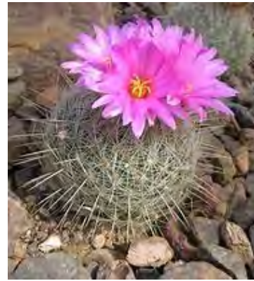
Cactus spp. *** many sizes and colors