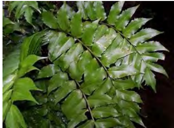
Holly Fern ( Cyrtomium falcatum ) **