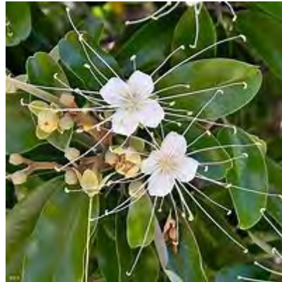
Jamaican Caper Tree ( Capparis cynophallojora )** 6-20h x 6-15w