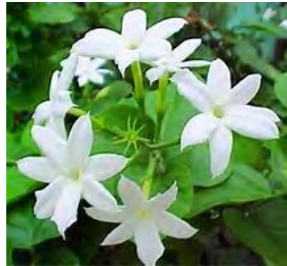
Jasmine ( Jasminium nitidum ) *** various sizes