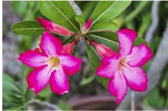
Dessert Rose (Adenium) *** 3 h