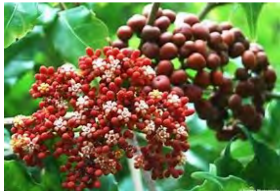
Hawaiian Holly ( Coccinea Rubra ) ** 6-8 h