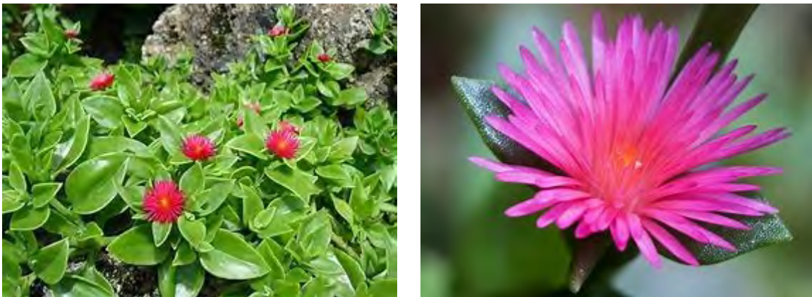
Baby Sun Rose ( Aptenia cordifolia ) ***