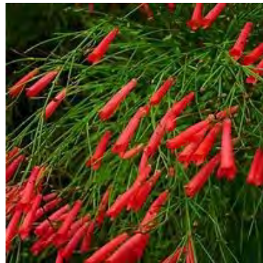
Firecracker Plant ( Russelia equisetiformis ) *** 3-5 h x 6-12 w