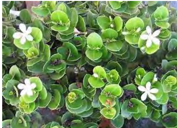
Emerald Blanket ( Carissa macrocarpa ) ***