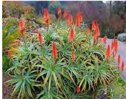
Aloe ( Aloe aborescens , Soap Aloe, etc.) *** 1-3h