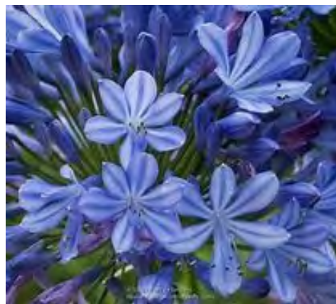
Lily of the Nile ( Agapanthus africanus )* 2 h