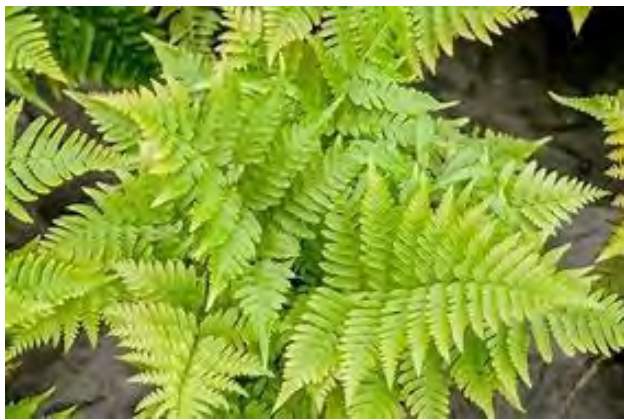
Autumn Fern ( Dryopteris spp.) *