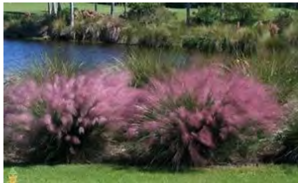
Muhly Grass ( Muhlenbergia capillaris ) *** 2-3 h x 3 w