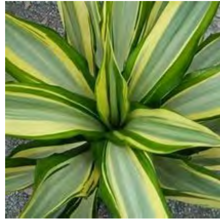
False Agave ( Furcraea foetida variegata ) *** 3-10 h