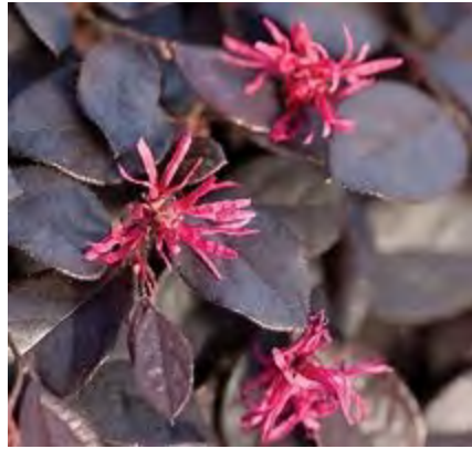
Lorapetalum (Lorapetalum chinense) *** 6-15 h x 8-10 w