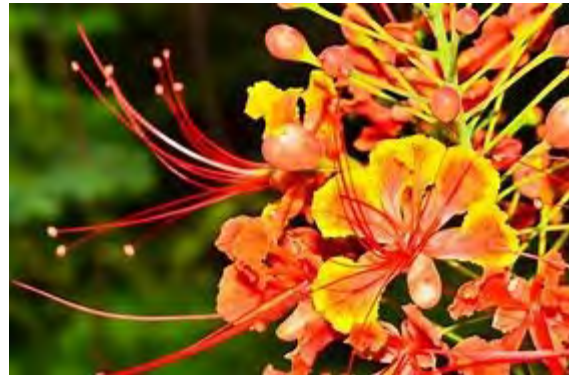
Poinciana ( Caesalpinia ) *** 8-35 h x 10-35 w