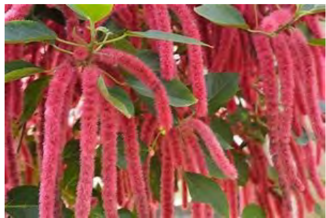
Chenille Plant ( Alcalypha hispida ) *** 4-6 h x 6-8 w