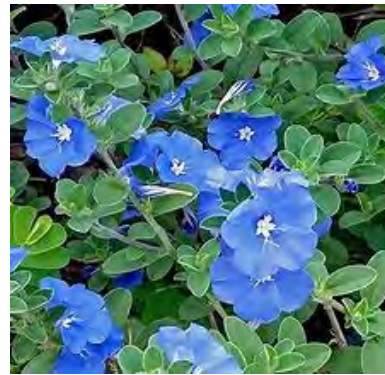
Blue Daze ( Evolvulus glomeratus ) ** .5-1 h x 1-2 w