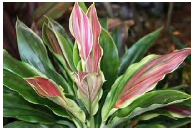
Ti plant ( Cordyline ) *** various colors