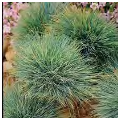
Crown Grass ( Paspalum quadrifarium ) *** 6 h