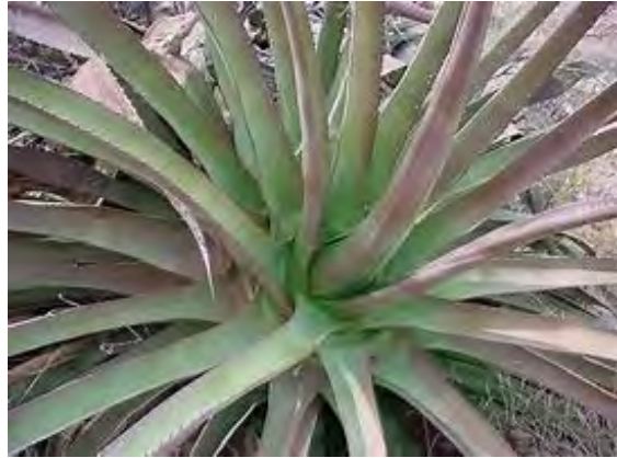
Agave (Century plant, Agave tequiliana , Caribbean agave, etc.) *** size varies