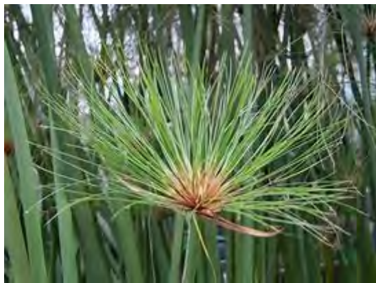
Papyrus ( Cyperus papyrus ) *** 13-16 h