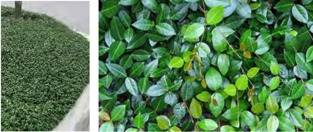
Asiatic Jasmine ( Trachelospermum asiaticum ) ***