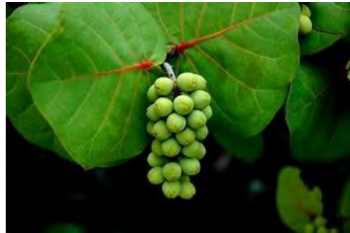
Seagrape ( Coccoloba uvifera ) *** 3-35 h x 10-50 w