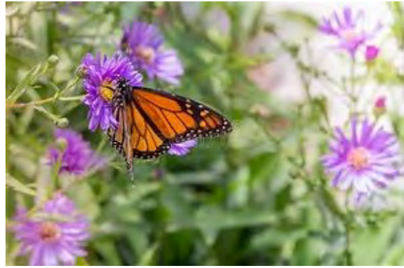
Horizontal Porterweed ( Stachytarpheta jamaicensis ) ***