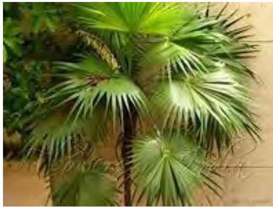
Florida Thatch Palm ( Thrinax radiata ) ***