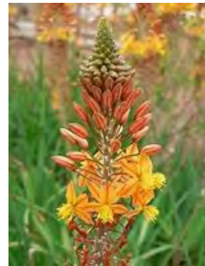
Bulbine ( Bulbine frutescens )*** 1-2 h