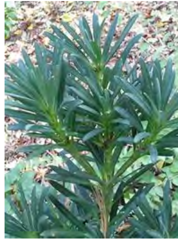
Podocarpus ( Podocarpus macrophyllus ) ** 30-40 h x 20-25 w