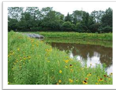
Native Beach Sunflower growing on pond’s edge

In accordance with recommendations from the University of Florida and the Institute of Food and Agricultural Sciences, residents living along ponds and other bodies of water should maintain a maintenance-free zone of at least two feet (2’) between the landscape and the water’s edge. This buffer zone along the waterfront should have hardy plants that receive no fertilizers, pesticides or irrigation after establishment.