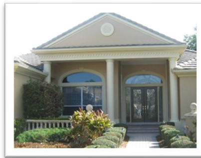
This home shows the relationship between the doors with inserts and side lights, the curved transom and the window to the side.

When the home was first built, the relationship between the glass in the transom and the door panels was consistent. Homeowners should be aware that a change in the style of the door may require a change to the glass or style of the transom.