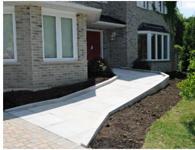
Handicap ramp complementary to the home

Homeowners may install a wheelchair ramp when it is necessary to access their home. If the homeowner elects to install a ramp on the exterior of the home, submit plans to the ALC prior to construction showing architectural specifications for the ramp. The idea is to construct a ramp that blends with the style of the home through a wise selection of building materials that integrate the ramp with the home's exterior.