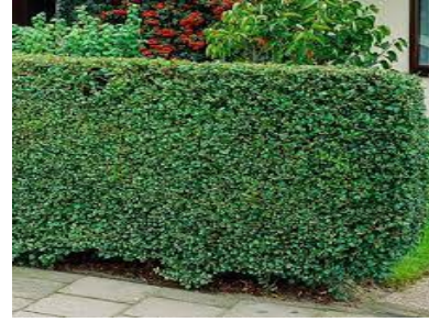
Examples of plants used to screen equipment