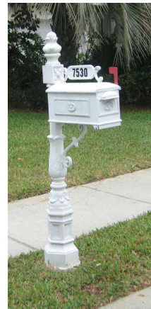
Barcelona style with Country Style post

Native Vegetation Pruning – See Golf Course Vegetation – Trimming