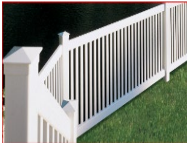
White PVC or Vinyl Fencing