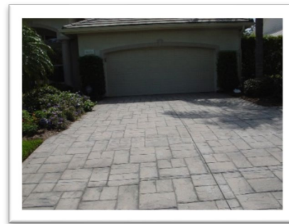
Etched Concrete Driveways