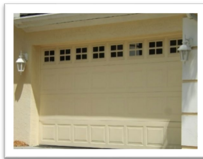
Stockton garage door (approved replacement style)

The preferred choice in garage door design is for it to be windowless so as not to attract more attention to the door over the architectural design of the home facade. In the event that windows are required, then the style Stockton may be approved.