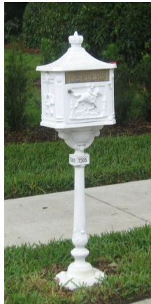
Victorian Style – in white and “Verde”