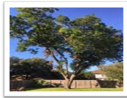
Over-pruned, lopsided tree