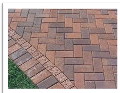
Pavers with complementary border