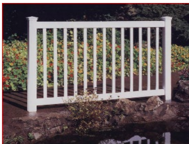
Victorian Pool Fence #1