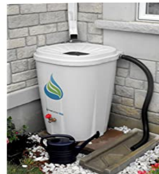
Installed Rain Barrel

The ALC has reviewed the types of barrels suggested and provides the following criteria and information for homeowners wishing to install barrels at their homes: