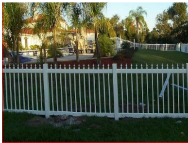
Diamond Picket #1