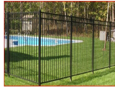
Black or Bronze Aluminum in "Wrought Iron" Effect, Prestige Top Rail

In all cases of fencing requests, applicants are advised that a landscape plan will be required showing screening to the proposed installation. Hedge-form material is to be the dominant landscape material in order to screen the fence from neighboring property. Tree forms and larger shrub material may be required to assist in minimizing the impact the fence may have on surrounding property.