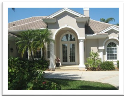
This home demonstrates the relationship among the doors with insert glass panes, the circle top transom and the window to the side.

In the examples below, the doors, adjoining windows and transom all relate to each other in shape and style.