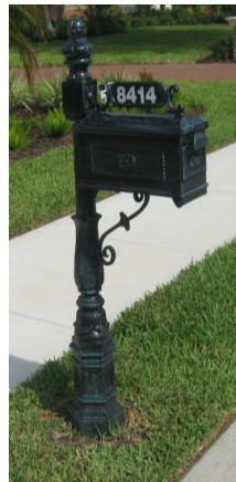
Barcelona Style – in white & “Verde” (black not shown)